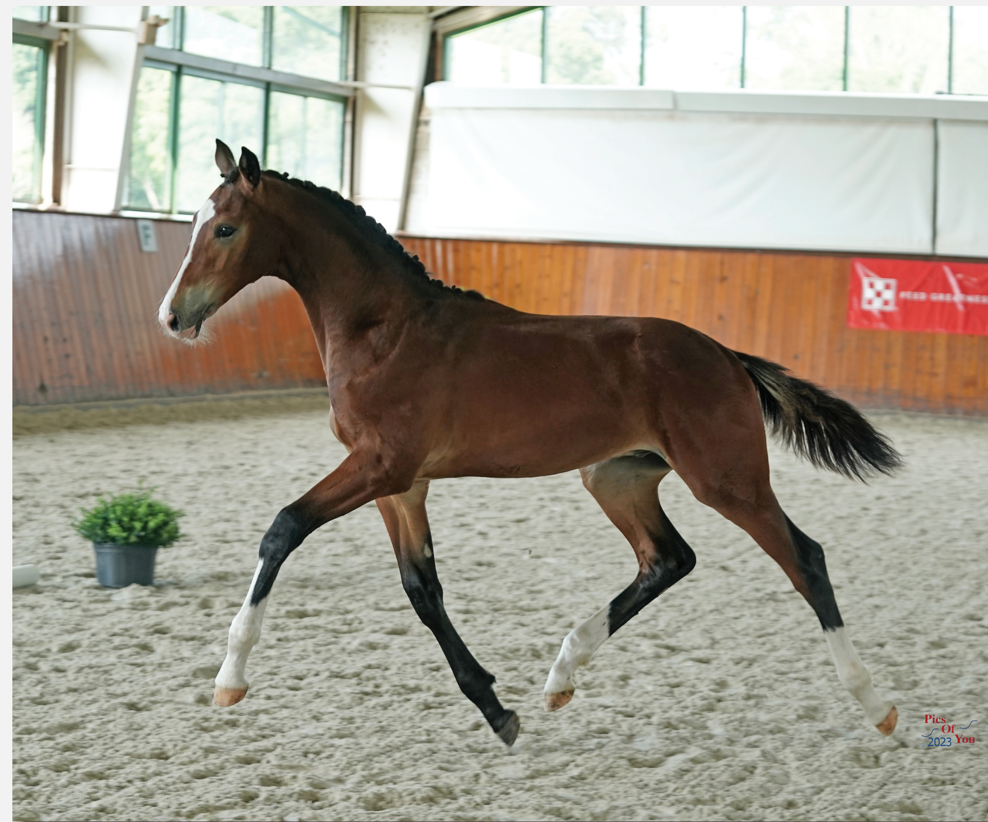
Pics of You 2023