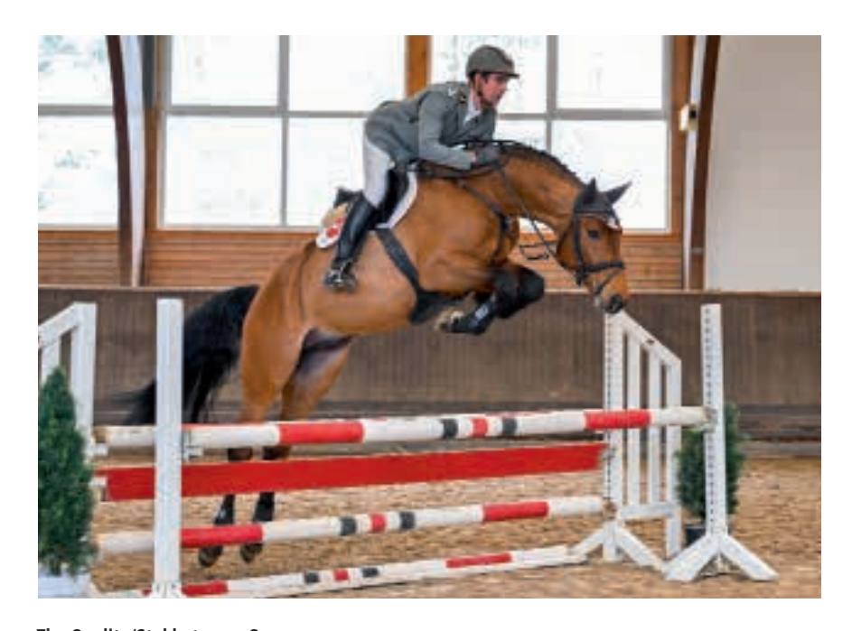
The Qualito/Stakkato son Quentino is in the service of the Celle State Stud. In Neustadt/Dosse he convinced with the third best result.