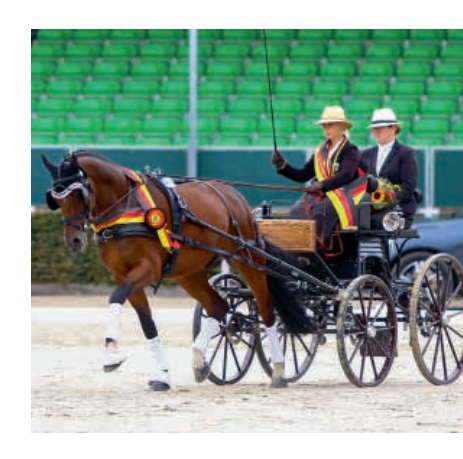
The Benicio/Lauries Crusador xx son Best Buddy is not only Bundeschampion and Vice World Champion, but is also successful in the dressage arena.

But Best Buddy is the best proof that a horse can be successful in two different disciplines." In order to make driving more attractive for a broader audience, we must also start rethinking the rules and regulations for international competitions, trainer Martin Röske is convinced: "For example, the cross-country test with its action-packed and sometimes spectacular rides is still a big spectator magnet, even if not everyone is an expert in this sport. The dressage competition is a completely different story. With a length of eight to twelve minutes, interest wanes after the fourth or fifth competitor at the latest – especially if you don't know exactly what it's all about. But both Jessica Wächter and Martin Röske are already looking forward to the start of the season in 2023, when they want to be successful again with Dream Catcher, Best Buddy and their other driving horses and showing the equestrian world how you can pursue this exciting sport with great passion. And maybe Jessica Wächter's dreams will then come true – to become the individual senior World Champion with Dream Catcher and to start driving four-in-hand.