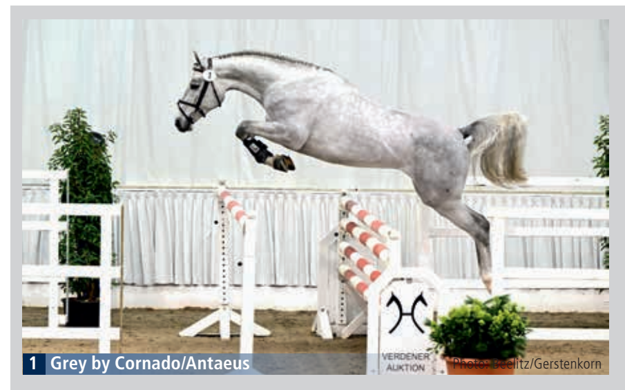
Breeder.: Wilhelm Harling, Sottrum, exhibitor.: Gestüt Eichenhain GmbH, Varste 75,000 Euros, Lower Saxony

The full brother of Büttner's Minimax — he is very similar to him in many ways: attitude, expression, scope and ability. Great hopes are placed on this powerfully performing and powerfully jumping stallion. As a three-year-old he already convinced over higher jumps and under the rider with good balance.