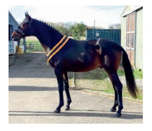
Champion stallion Ducati