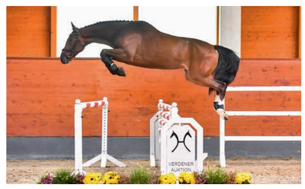
The Colman/Escudo son Camelot PJ led the statistics of the show jumpers with a knock down price of 33,000 Euros.