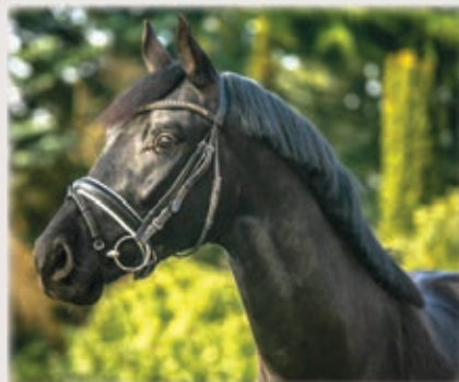
FÜRST GRIBALDI Fürstenball - Gribaldi

Visit us online to choose your favorite stallion