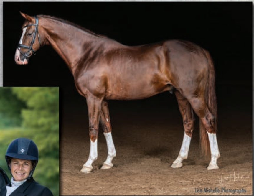
Lise Michelle Photography