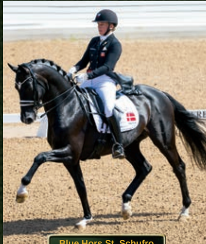
Blue Hors St. Schufro