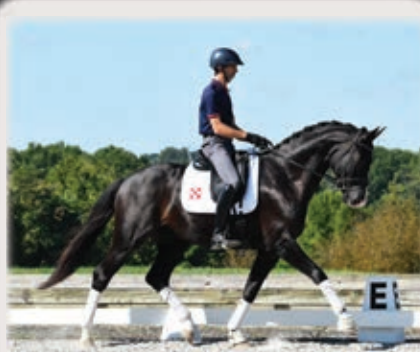
SIR REAL Sir Donnerhall I - Fürst Heinrich I