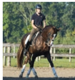
First Dance Bridlewood Farm