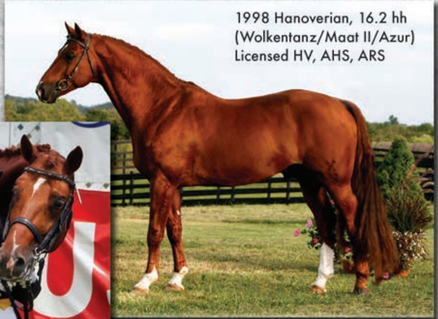
1998 Hanoverian, 16.2 hh (Wolkentanz/Maat II/Azur) Licensed HV, AHS, ARS