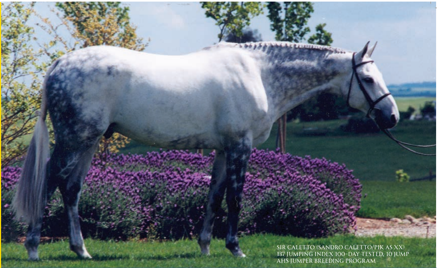
SIR CALETTO (SANDRO CALETTO/PIK AS XX) 137 JUMPING INDEX 100-DAY TESTED, 10 JUMP AHS JUMPER BREEDING PROGRAM