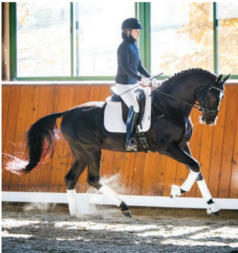
Daily Show (Danciano x Schwedenlady/Stockholm)