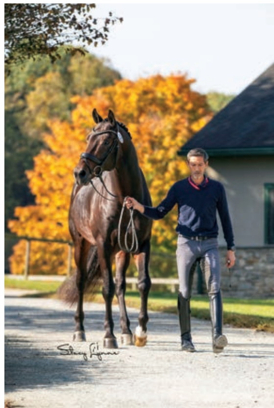
Louisville HTF (Lord Leatherdale x Unicum-D/Negro)