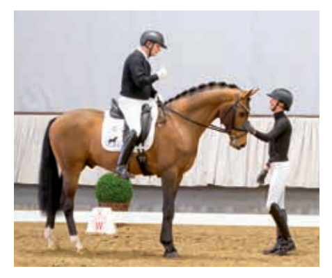
Thumbs up for Va'Pensiero.