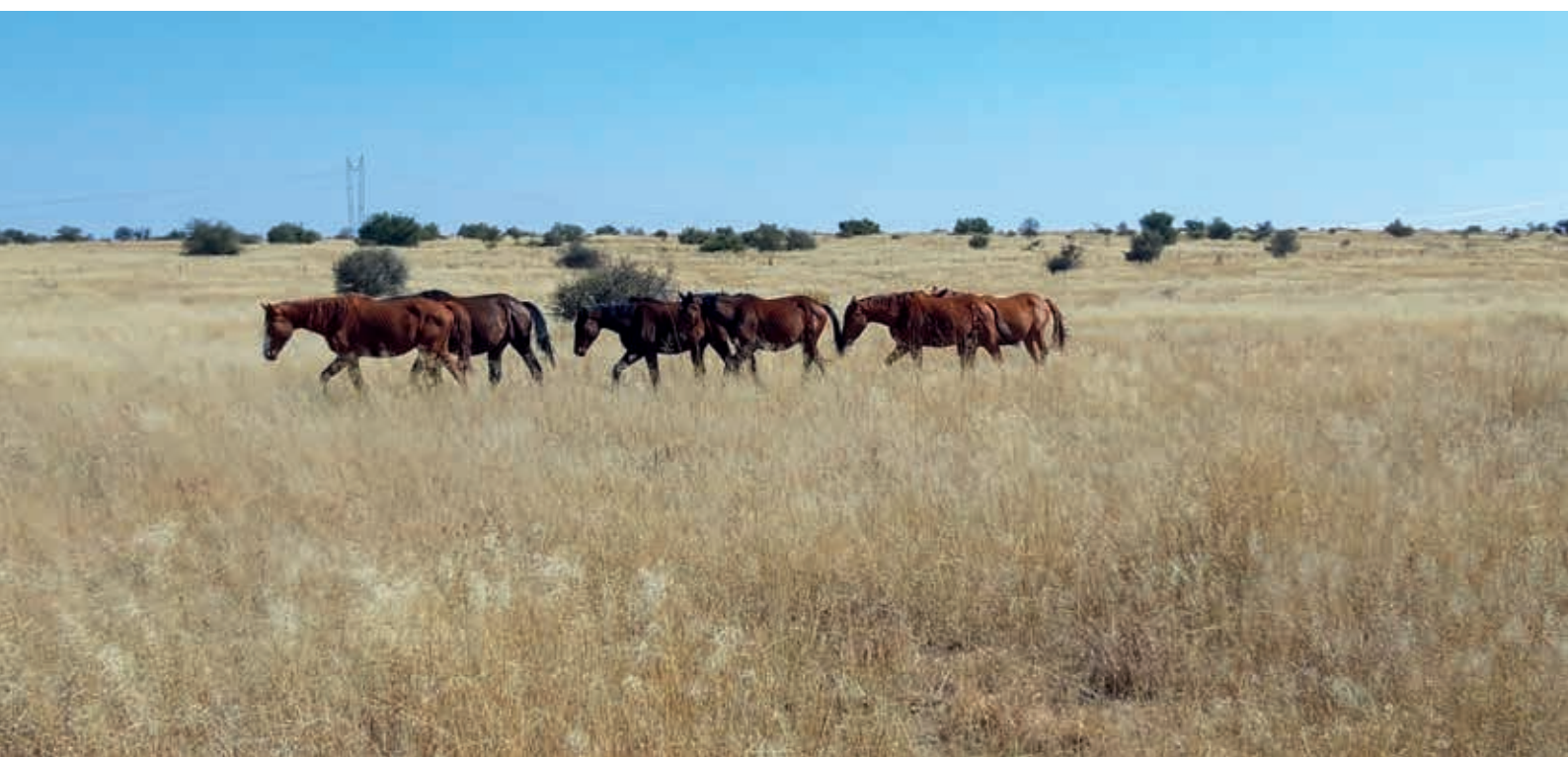
Plenty of space: Herd of young stallions at Voigtskirch Farm in the Khomas Highlands.