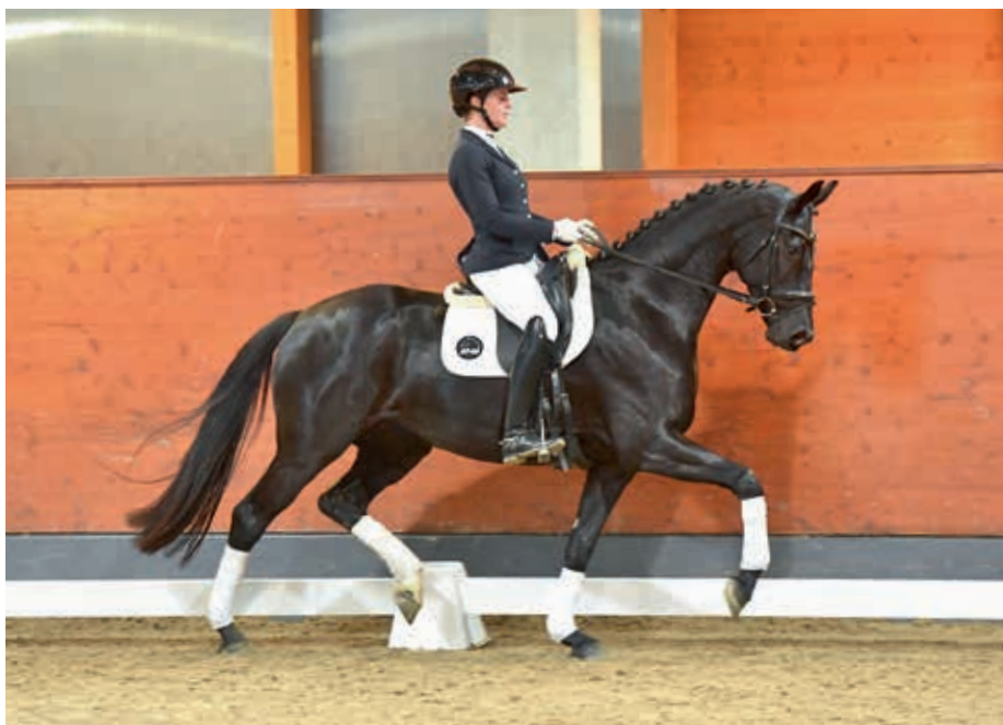
Moves into a box next to her half-brother: Grand Galaxy Cordey by Grand Galaxy Win/Fürstenball was sold at 39,500 Euros.