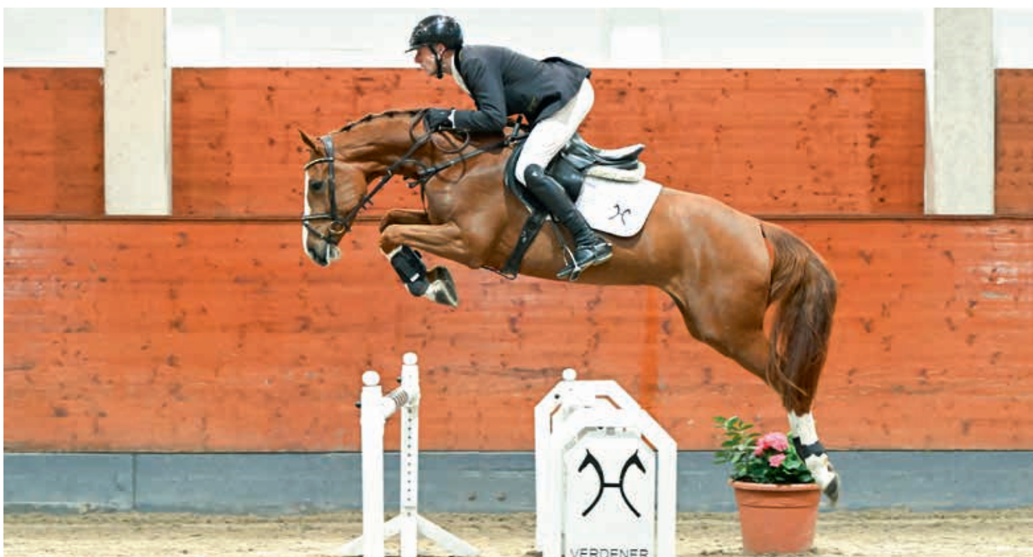
The highly talented show jumping mare Napoli-Tana by Nixon van het Meulenhof/Quidam de Revel found a new owner in Sweden for 50,500 Euros.