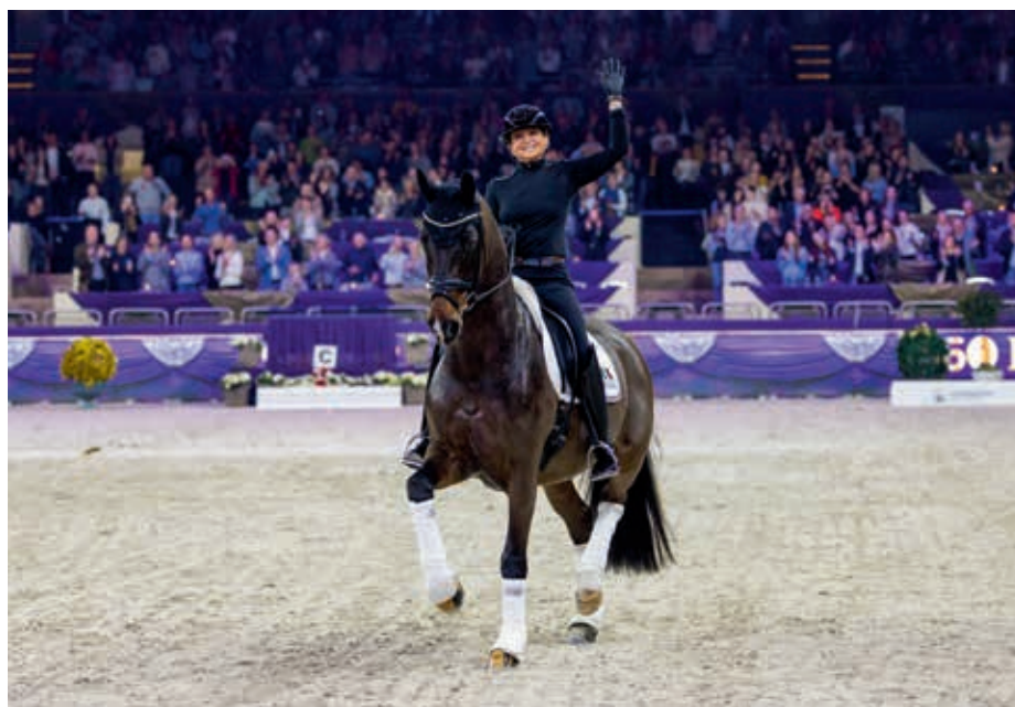
"The show must go on" – Showtime FRH by Sandro Hit/Rotspon was retired from the sport in Frankfurt.