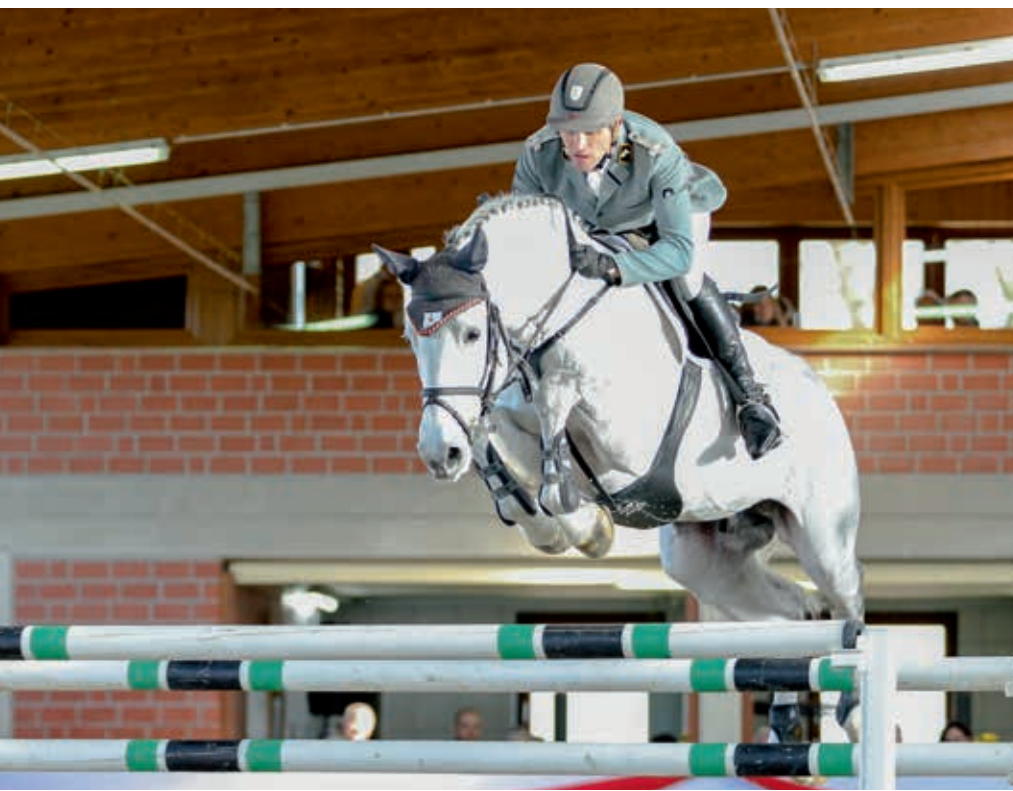
Diacontinus by Diarado/Contendro occupies a top position in the breeding value estimation of show jumper sires.