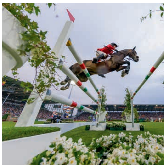
Lady Gaga by Lord Pezi/Fly High was awarded Hanoveraner Mare of the Year. Her son Commissar Pezi by Commissario reached new heights with Suisse Martin Fuchs.

rates relevant data for the evaluation of horses and breeding value estimation, a similar long-term development applies in terms of quantity as for mare shows (2015: 41 tests, 837 mares; 2022: 46 tests (incl. sport test), 585 mares; 2023: 43 tests (incl. sport test), 540 mares). More striking than in previous years appears to the evaluation committees that the mares appear for the test with less and less riding experience on average. This makes it more difficult to award these lifetime marks and regularly leads to different quality assessments by the evaluation committee, third-party riders and exhibitors. The Hanoveraner sport test for the disciplines of dressage, show jumping and eventing is still in the process of being established as an alternative to the mare performance test. It is intended to pave the way to the Hanoveraner Premium for breeders who are initially embarking on a sporting career with their young mares and im-