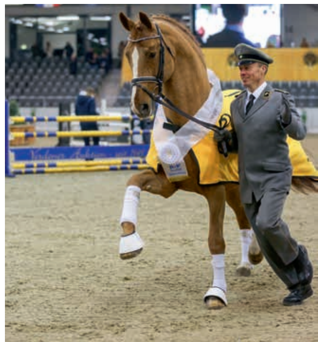
The price highlight of the 140 th Elite Auction was the Secret/Belissimo M son Semeny N, who found a new owner in Bavaria for 140,000 Euros. I The Celle state stud stallion Edward by Embassy/Fabiano was celebrated as Hannoveraner Stallion of the Year.

auctions (2022 total 9,722 Euros net, 2023 total 8,580 Euros net), it was possible to build on the previous year, particularly thanks to the good results of the large presence auction in August and the elite auction. In the preliminary planning for 2023, the Marketing Committee pursued the approach of also offering foal marketing opportunities to breeders who did not receive auction approval at first glance. The resulting online foal auction "Breeder's Offer" for around 100 foals provided a real sales opportunity in the lower price segment, while the foal market in the country declined across the board. Association foal marketing, including two competition foal auctions held