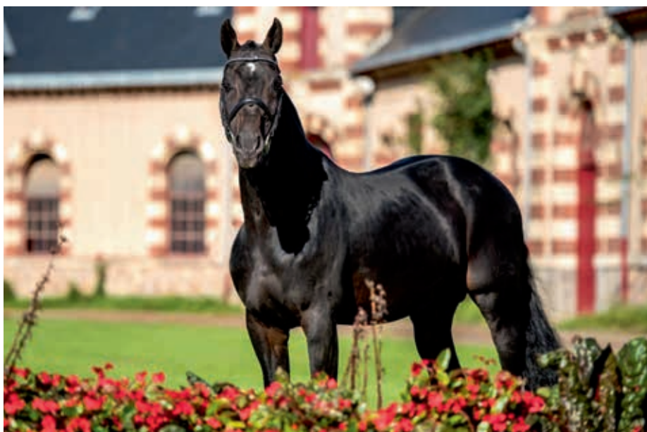
Contendro by Contender/Reichsgraf.