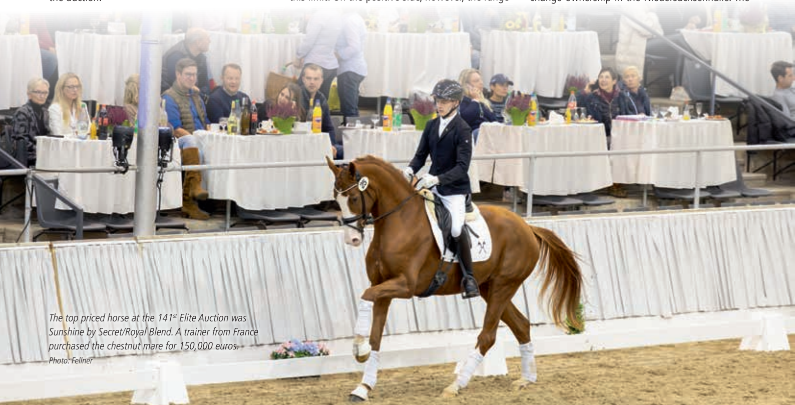
The top priced horse at the 141 st Elite Auction was Sunshine by Secret/Royal Blend. A trainer from France purchased the chestnut mare for 150,000 euros.