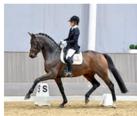
In the sport test dressage part I in Münster-Handorf Sir Gribaldi by Secret/All Inclusive set the standards.