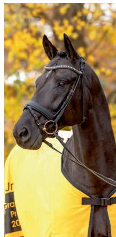
The show program presented Olympic participant Toto Jr. by Totilas/Desperados. He was awarded the Grande Prize in spring.