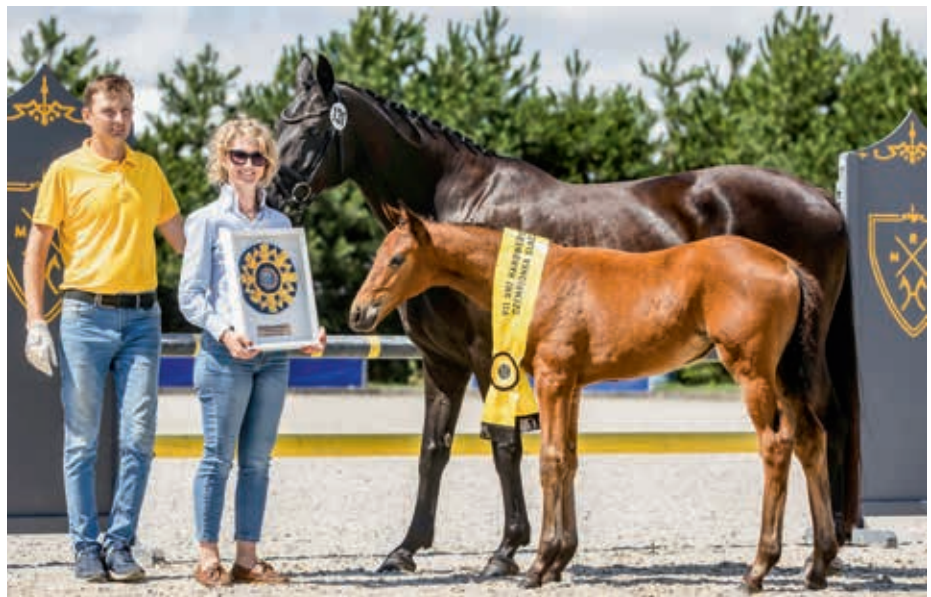
„Overall Champion“-Foal in Poland became Venus by Va Bene/Don Frederico.