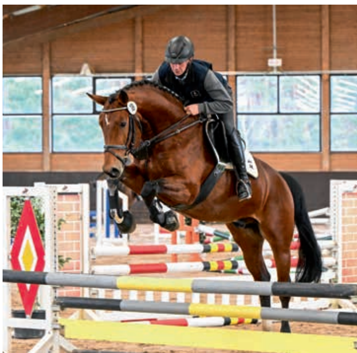
Emerald by van het Ruytershof/Ludwig von Bayern-son Elton presented his talents as the second-best of the 50-day test in Adelheidsdorf.