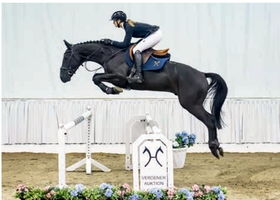
The most expensive horse at the November auction was the Chubakko/Stakkato son Chubakka Black, which was sold to Great Britain for 37,000 euros.