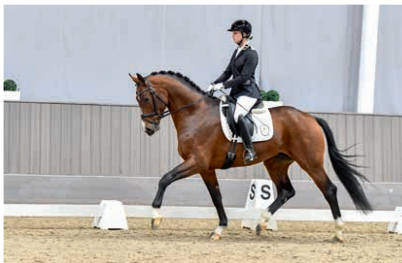
In Münster-Handorf, Verbier by Von Und Zu/Dancier achieved the best result in the three day short performance test (left). The Bon Vivaldi/Royal-Blend son Benjamin Franklin, owned by the Celle State Stud, came in second.