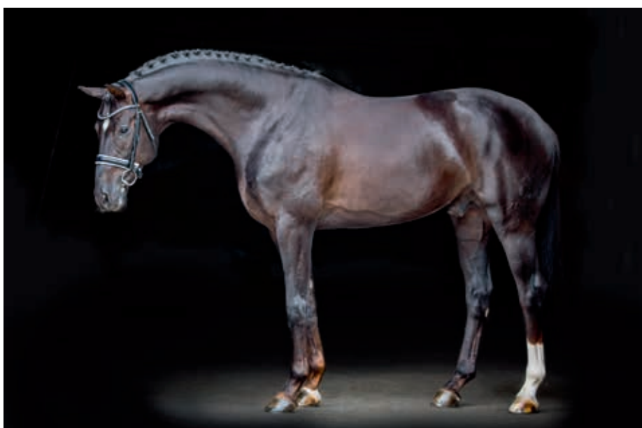
Livaldon by Vivaldi/Donnerhall.