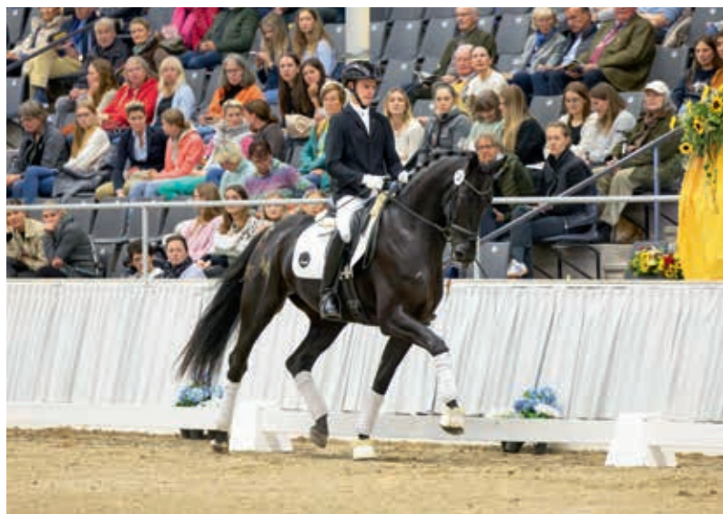
The Valdiviani/St. Schufro son Von Otto S sold for 92,000 euros to a Canadian owner (left) | Total Happy H by Total Hope/Sezuan goes to a well known dressage rider for 105,000 euros.

first was a licensed stallion by Franziskus, who was followed four years later by the not licensed Emperio by Escolar, who has already celebrated victories in tests for young dressage horses as a five-year-old.