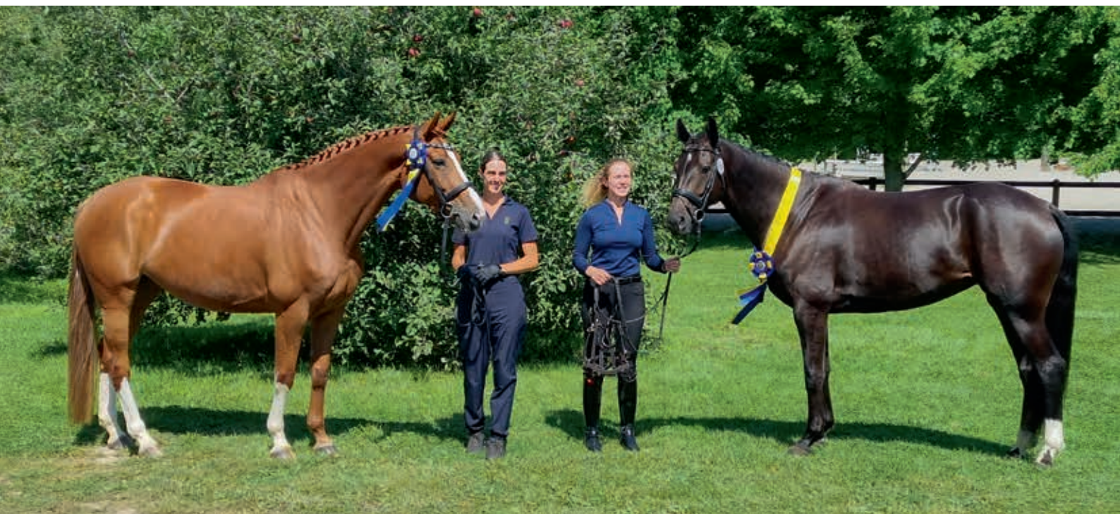
Winning mares at Old Orchard Farm in Canada: Reserve Champion Red Label by Rock Springs/San Remo (left) and Champion Dolly Parton by De Niro/Ehrentusch.

The foal show on the occasion of the Hannoveraner Day in Kunowo, Poland, was well attended, with 25 foals and a large audience. In Denmark, on the other hand, the mares were the focus of attention at the two breeding dates at the beginning of June. For many breeders, it is too early in the season, so that the majority of foals will not be registered until August during the so-called "chip tour". The foal show at Fonteabetti Stud in Arezzo, Italy, is particularly noteworthy. Due to the large number of 30 foals, a separate foal show was held there. ✂