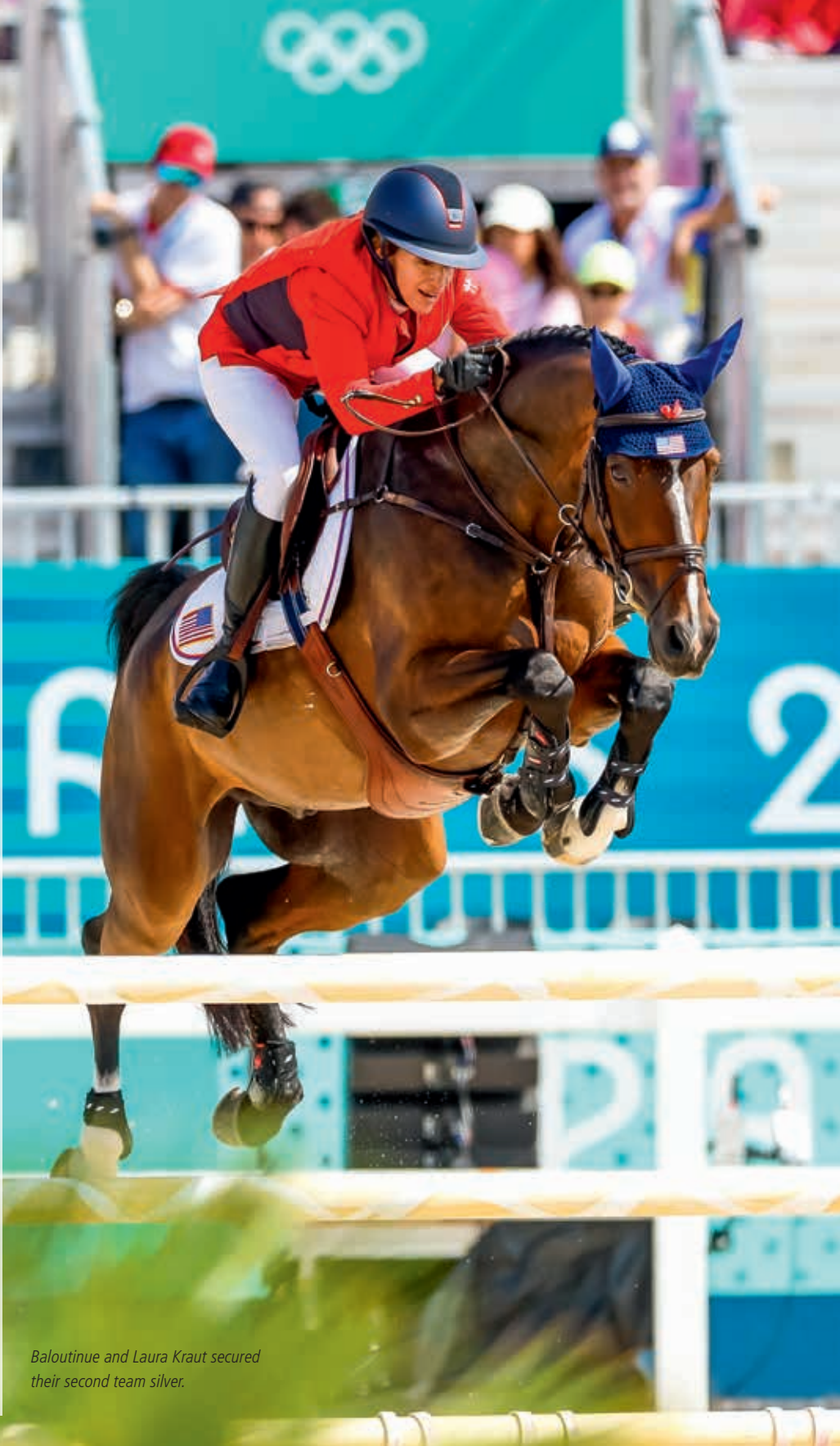
Baloutinue and Laura Kraut secured their second team silver.