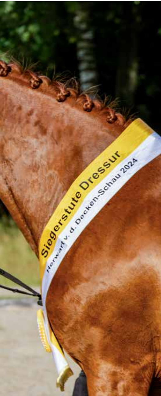
Champion Mare Hann.Pr.A./Ext+ Vision L by Vitalis/ Fürstenball (right) and Reserve Champion Mare Hann. Pr.A. Vida Colorida by Valdiviani/Sandro Hit.