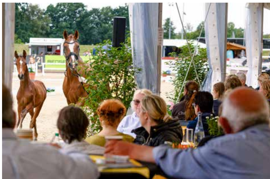
At the presentation in the morning, the horses and visitors inspected each other.