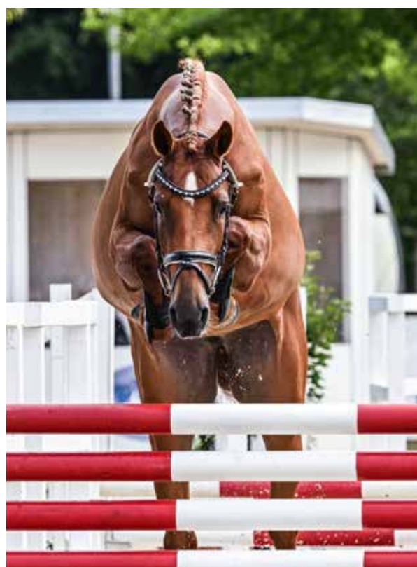
A true athlete: Champion Mare Hann.Pr.A. Exquise by Eldorado van de Zeshoek/Verdi (left) | Reserve Champion Mare Hann.Pr.A./Vet+ Ulrieka by United Way/Comme il faut NRW.

Congratulations to Hannover's show jumper breeders. We have seen a Champion Mare that we need in the sport!