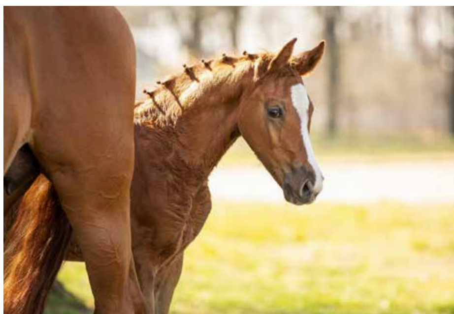
Three years ago, St.Pr.St. Shakira's Chacoon Blue-son Coldplay H was part of the collection of the April auction of the Verden Foal Spring and, at 26,500 Euros, led the price statistics of the show jumping foals.