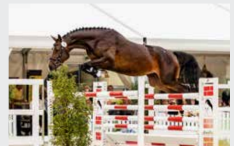
Hann.Pr.A. Diabella