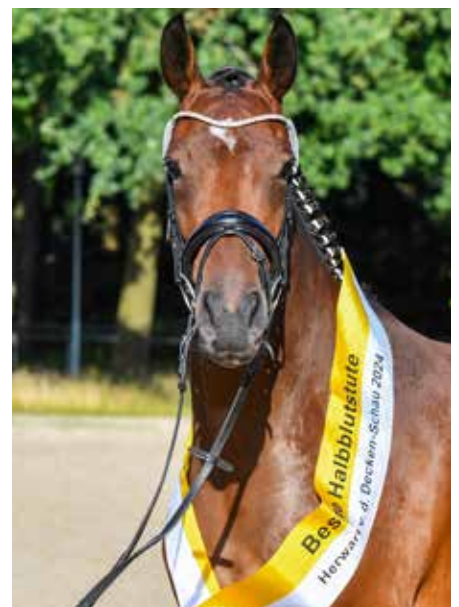
Vitschuna HM by Vidar/Lando xx was honoured as the best half-blood mare of the past show season.

show winner in terms of type, but she was outstanding in movement and was named the champion dressage mare. In the trot, she showed great elasticity, much rhythm and powerful take-off – characteristics that she also showed in the walk and was among the best of the day. The Vitalis daughter had already demonstrated her good basic gaits two days before the show in the qualifier for the Hannoveraner Championships for riding horses. She also showed herself to be equally powerful and elastic under the rider: a mare that reveals special riding horse qualities. The fact that the performance aspect is also covered with the dam's Grand Prix-successful siblings – Facilone FRH by Fürstenball with Helen Langehanenberg and For Sure by Finest with the Portuguese Francisco Villa Nova – at Hann.Pr.A./Ext.+ Vision L, ultimately rounds off the decision in favor of this outstanding mare, who was also one of the first mares to be awarded the conformation premium Ext+.