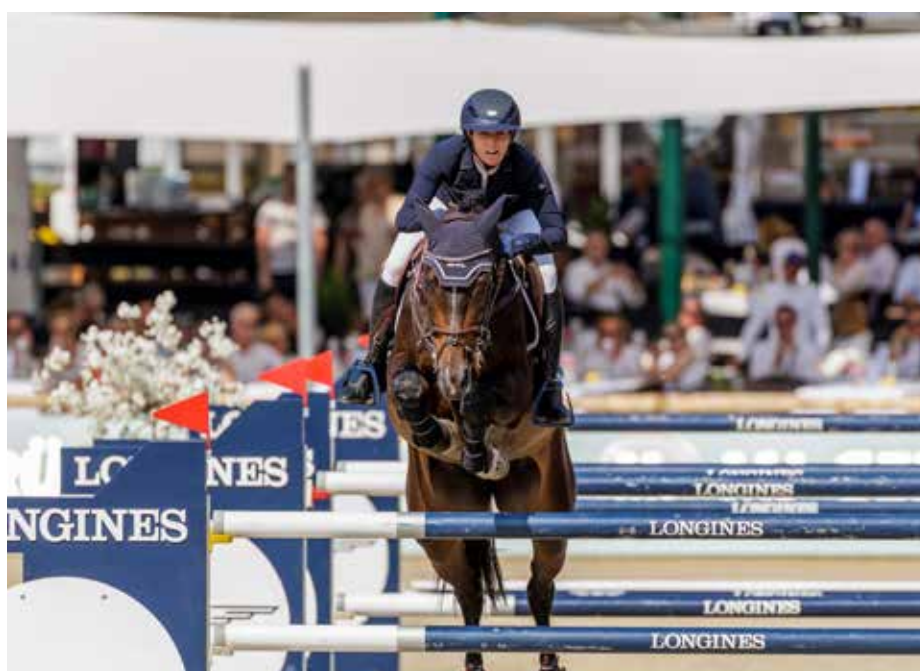
Quirici H by Quaid/Escudo and Sandra Auffarth celebrated the first major Grand Prix victory of their career in Falsterbo.