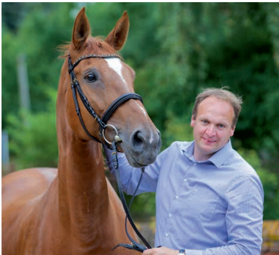
The Stakkato/Laptop daughter St.Pr.St. Shakira is the dam of Hann.Pr.St. Lapalu H, Nero van de Helle by Numero Uno, Quality H by Quaid as well as the two Verden auction horses Coldplay H by Chacoon Blue and Vet+ Quaja by Quaid.