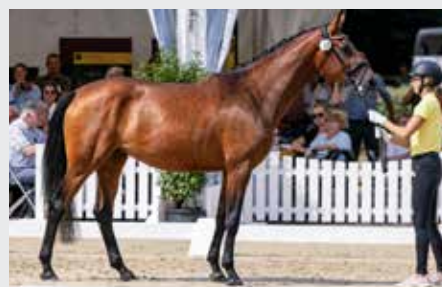
Hann.Pr.A./Ext+ Florys Dream