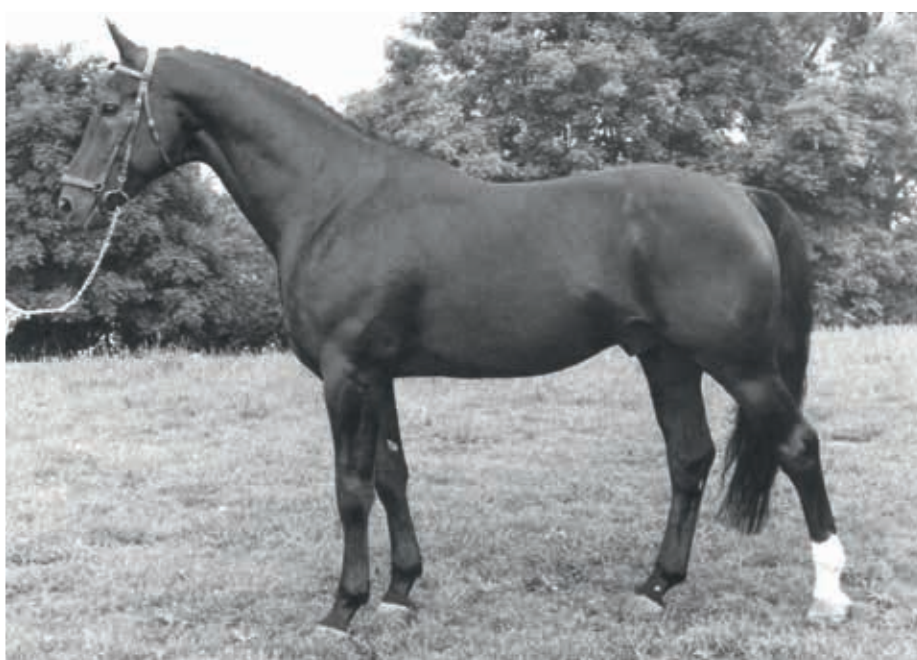
The former Celle state stud stallion Goldfinger by Gotthard/Marconi impressed with his flawless conformation.

success at the same time. I will do everything I can to keep it that way, although of course it won't be easy to breed another exceptional horse like Quality H." ✂