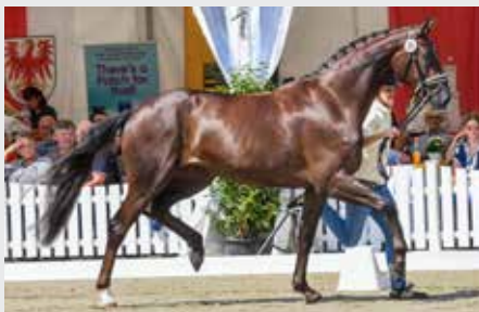
Hann.Pr.A. Bonida