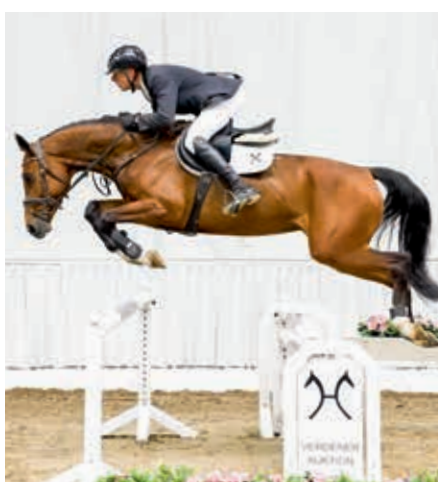
Quinett by Qualito/Calido sold for the top price of 45,000 Euros.